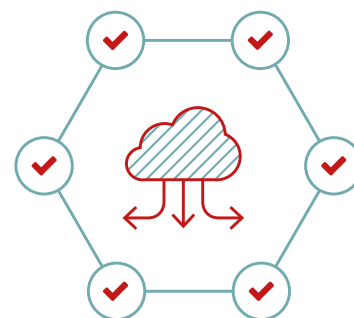
Helsana's data ecosystem needed modernizing

Helsana is the largest health insurance provider in Switzerland with 1.9 million customers and a turnover of 6.4 billion Swiss Francs. The BI team's reliance on hand coding meant that scheduled releases took too long. Now, Data Automation allows them to use their existing infrastructure in an agile manner that vastly speeds up time to value and reduces expenditure on external resources.