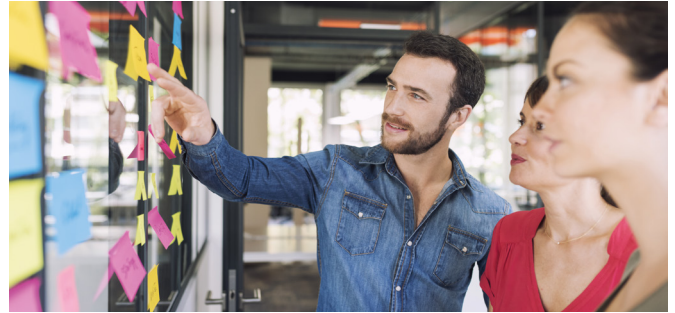
Data Automation has enabled Helsana to initiate Agile methodologies

WhereScape 3D allows visual prototypes to be quickly spun up to confirm requirements with business users in order to avoid misunderstandings – potentially shortening development cycles from months to days. WhereScape RED then physicalizes the models by writing thousands of lines of native code in seconds, committing the necessary changes to the underlying code without human error.